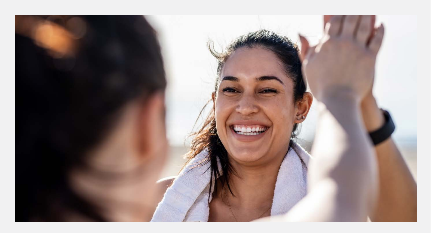
Hearing and vision care