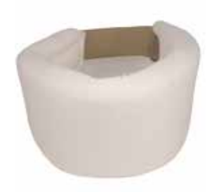
Cervical Collar Item No. 1241