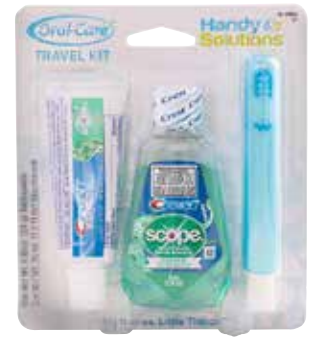
Dental Travel Kit Item No. 1749