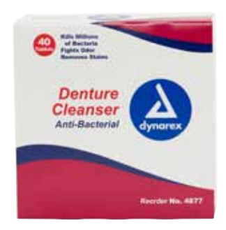
Denture Cleaning Tablets Item No. 1032