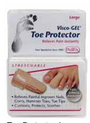
Toe Protector, Large Item No. 1787 $900