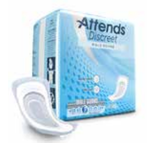
Attends® Discreet Men's Guard Item No. 1811