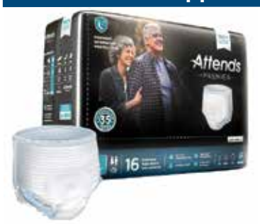
Premier® Disposable Underwear, Large - 44" to 58" Item No. 1991