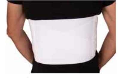
Back Support Elastic - 24" to 46"