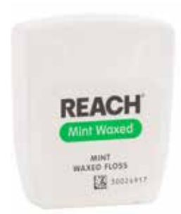
Dental Floss, Reach® Waxed - Mint Item No. 1455