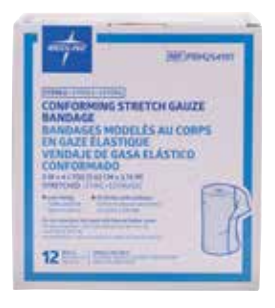
Bandages, Gauze Sterile, Conforming Stretch - 3" x 4.1 yd