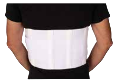
Back Support Elastic with Lumbar Item No. 1488