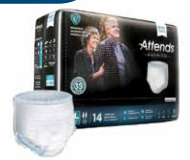
Premier<sup>®</sup> Disposable Underwear, X-Large - 56" to 68" Item No. 1992