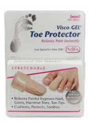
Toe Protector, Small Item No. 1788 $900