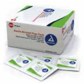
Alcohol Pads Item No. 2004